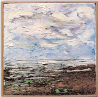
■ seascape vol.1 oil on canvas approx size: 250x250x25mm