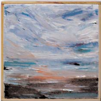
■ seascape vol.2 oil on canvas approx size: 250x250x25mm (incl. stand)