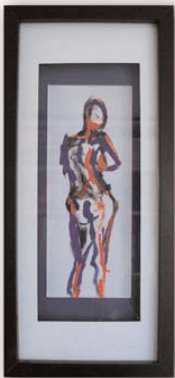
■ blude oil sketch | framed approx size: 470x210x50mm