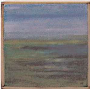
■ seascape vol.3 oil on canvas approx size: 200x200x25mm