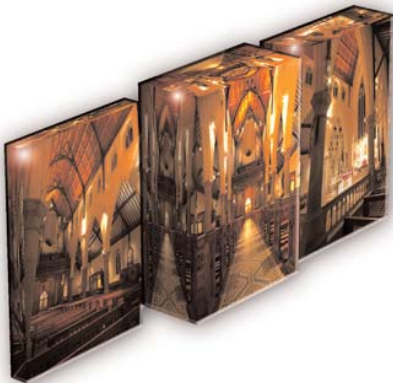
■ rowe street church acrylic box prints x 3 [varying depths]